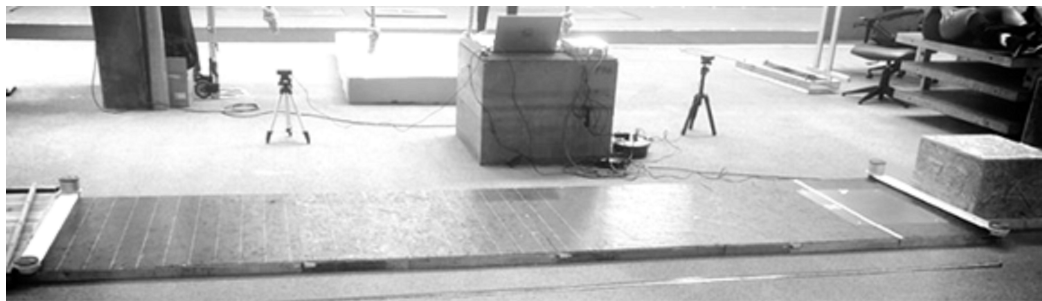
Figure 1 Wooden platform made for this study.