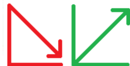
Figure 3 Red arrow down and green arrow up.

The MHC-SF is a self-report questionnaire measuring treatment outcomes in terms of positive mental health. The MHC-SF is based on a long version (MHC Long Form), which consists of 40 items. 48 Its short form contains 14 items and includes three components of well-being: Emotional (3 items), Psychological (6 items) and Social Well-being (5 items). The items are scored on a 6-point scale ranging from never (0) to every day (5). The sum of the three scale score represents the respondent's experience of overall positive mental health. Emotional well-being is about life satisfaction and positive feelings, such as happiness, interest and pleasure in life. 49 Psychological and social well-being focus on the optimal functioning of people rather than on the experience of satisfaction and happiness. Psychological well-being