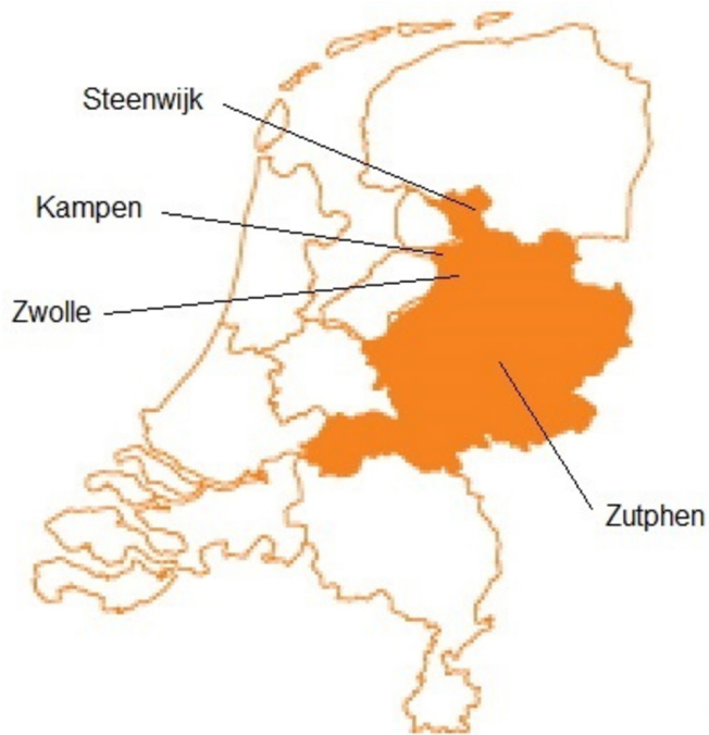
Figure 2 Participating centres.

Improvement on the KKL, in the final measurement compared with the baseline, showed no significant differences for all four centres, and also no significant differences with the overall Mindfit organisation in the year prior to the study (see table 1 ).