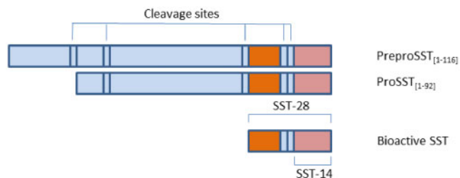
FIGURE 1: SST: its precursors and cleavage products (modified from Patel et al. [13]).

SST can act on multiple cellular targets via a family of five receptors: SST receptor (SSTR) 1–5 [15]. The SST receptor