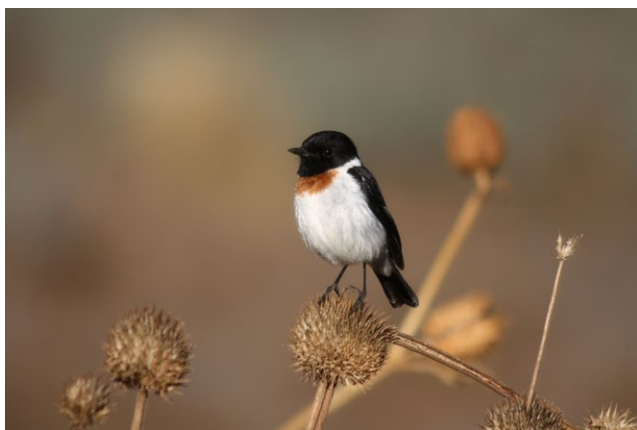
FIGURE 1 Adult male African stonechat

Here, we compare telomere length of two closely related sister taxa of stonechats, Saxicola torquatus axillaris (Figure 1) and Saxicola rubicola that breed in tropical and temperate environments, respectively (Doren et al., 2017; Urquhart, 2002). At all latitudes, stonechats are socially monogamous, open habitat, insectivorous passerines that aggressively defend breeding territories (Apfelbeck, Mortega, Flinks, Illera, & Helm, 2017). However, they vary in pace of life according to their environment (Ricklefs & Wikelski, 2002). Stonechats show a latitudinal cline in metabolic rate, with genetically inherited, higher metabolic rates in higher-latitude populations (Klaassen, 1995; Tieleman et al., 2009; Versteegh, Schwabl, Jaquier, & Tieleman, 2012; Wikelski, Spinney, Schelsky, Scheuerlein, & Gwinner, 2003). Further, temperate stonechats have a genetically fixed larger clutch size than tropical ones (Gwinner, König, & Haley, 1995), and their higher fecundity correlates with elevated baseline corticosterone concentrations during the breeding season (Apfelbeck, Helm, et al., 2017). In agreement with lower adult extrinsic mortality in tropical environments, local survival of tropical stonechats appears to be much higher than that of temperate