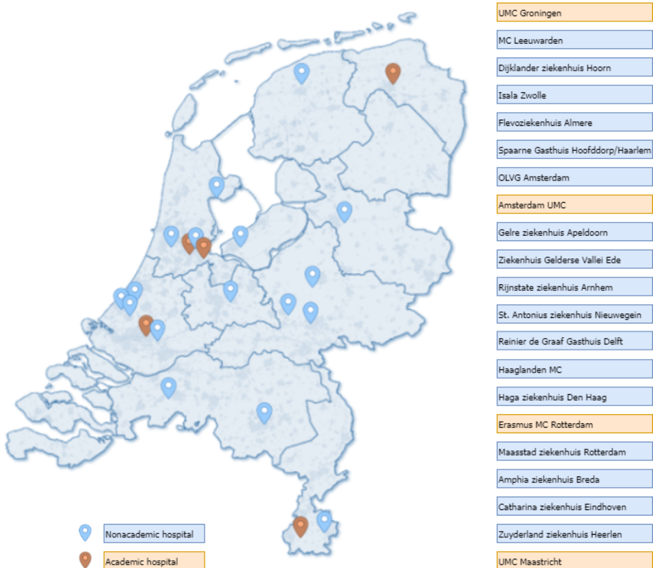
Figure 2. Participating hospitals of the Steroids in Hospitalized Patients with COVID-19 in The Netherlands (SELECT) study. UMC: University Medical Center. MC: Medical Center; OLVG: Onze Lieve Vrouwe Gasthuis.