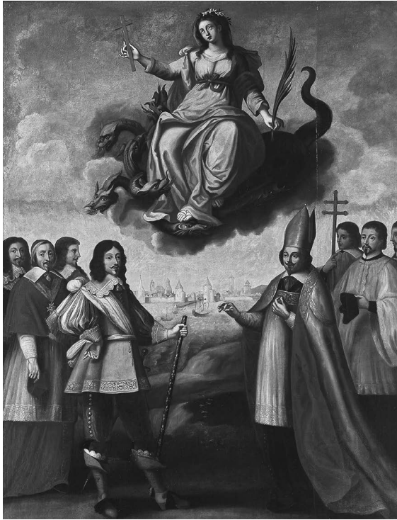
Figure 5.2 Pierre Courtilleau, Entry of Louis XIII in La Rochelle on November 1, 1628 , oil on panel, 185 × 143 cm.

Courtesy of Musée des Beaux-Arts, La Rochelle (MAH.1952.13.1).