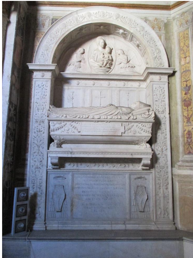
Fig. 1: Andrea Bregno and Mino da Fiesole, Tomb monument of Cristoforo and Domenico della Rovere, circa 1478-1481, Rome, Santa Maria del Popolo, Cappella di San Girolamo.

only one effigy should be interpreted, it is therefore necessary to take a closer look at this tomb and its inscriptions.