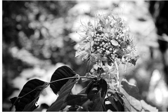
PLATE 1. The Ashoka tree ( Saraca asoca (Roxb.) Wild., Caesalpinoideae, Fabaceae) naturally occurs in the wet evergreen forests of the Western Ghats of Karnataka. It is a sacred tree for Hindu and Buddhist religions and is used as an important component in Ayurveda traditional medicine.

when applied to the simulated samples and provided realistic estimates for the forest plots, in agreement with the values found by Hubbell (2001:144–147) for semievergreen and evergreen forests in central America. This improved estimation of neutral parameters through a two-scale framework may represent a valuable contribution for a better understanding of the spatial dynamics of tree diversity in such forests. Noticeably, the variation of \hat{m}_i across samples could be further analyzed in relation to the ecological context of the different plots.