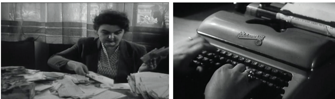
Figure 1a-f. Different technical and creative professions performed by women in a 1961 Czechoslovakian radio studio. 22