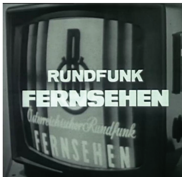
Figure 2. The original title Rundfunk Fernsehen is echoed in the picture on the television screen 'Österreichischer Rundfunk: Fernsehen'. 27

In an Austrian clip for school television titled ' Radio-Television ' (1966) presenting a history of television, radio appears as mostly a step towards television . The English title, which created the search hit, seems to be something of a mistranslation: the original German title Rundfunk-Fernsehen would perhaps have been better rendered as 'television broadcasting'. But to an extent, this mistranslation captures the uncertainty around the two terms, and points to the genealogical imagination of television as radio with pictures, captured also in Dutch in the term beeldradio ('image radio') and in the German word Bildfunk which was used during the development phases of television. In the opening sequence of the clip ('00:50-'01:05), television 'quotes' itself with a close-up on a television set. The title ' Rundfunk Fernsehen ' (Figure 2) is echoed in the picture on the television screen ('Österreichischer Rundfunk: Fernsehen') and the voiceover announcement from the television set ('This is the Österreichischer Rundfunk with its television programme'). This a subtle shift of meaning from the programme's title: Rundfunk here marks the name of the institution , and Fernsehen specifies the medium itself. Thus, while the title of the programme seems to sketch a general development of a technology, it is immediately ideologically bound up with the national institution.