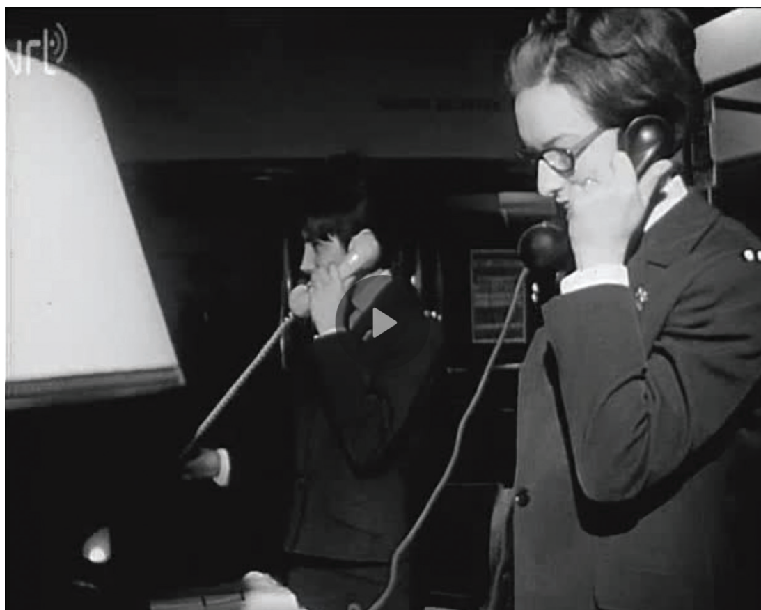
Video 2. Public Broadcast , VRT 1966. Go to the online version of this article to watch the video.

Openbare Omroep (Public Broadcast) (1966) which presents the Belgian VRT's public broadcasting building at the Place Flagey square in Brussels, is a more straightforward 'behind the scenes' documentary, showcasing the generic bustle of an office space over the technical power and know-how of the station. People pushing telephones and paper dominate, with roles between men and women much less visually defined. The moment of focus on technology features a montage of recording technologies ('01:36-'02:02), and while the voiceover suggests this is strongly technical work ('How many technicians spin the records?') the technologies do not look considerably different from that of home technologies – particularly the gramophone record, but also the ¼' tape - plus the operators themselves are barely shown. Indeed, only when the documentary turns to television (circa '02:05), do broad banks of technical equipment become strongly foregrounded - and among the technicians a woman is clearly visible ('03:27). Curiously, about the most consistently gendered technology on display throughout is the typewriter, which is only shown being operated by women.