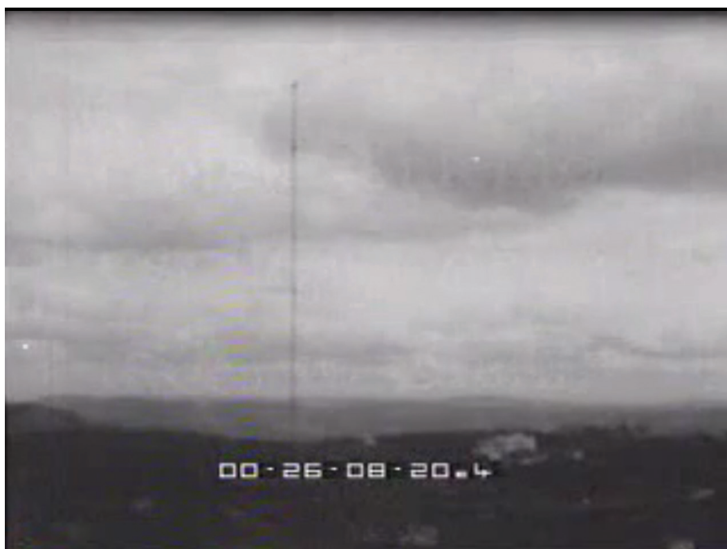
Video 7. Implementing and developing radio in Sicily , LUCE 1951. Go to the online version of this article to watch the video.

The visuals are at best vague about the geographical reach and intent of the radio station. In fact, the antenna ultimately served not only its immediate region, but also reached much of the Mediterranean, including Spain and North Africa. To a certain extent it was a kind of counter-pole to the long-established international transmitter in the Adriatic port of Bari, famous since the 1930s for its Arabic broadcasts 36 – and shown briefly in this 1962 newsreel ('03:16-'03:29) with tell-tale static sounds, also as a site of the radio receiver industry. In spite of this potential importance outside of national territory, the newsreel itself highlights for a domestic audience the new transmitter's role in shoring up radio's territorial function, saying it will 'solve the radio problems of Sicily and large parts of Calabria'. Comparing this video with the other clips on international broadcasting that feature montages of voices and languages also underlines the extent to which the clip actually silences the 'voice' of the station. Following a montage of scenes building up to a view of speakers in the studio, the clip stops just before they begin to speak, and thus avoids the politics of accent and dialect in claiming the airwaves over Southern Italy as national territory.