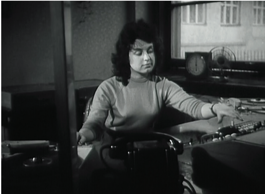
Video 3. The Czechoslovak Newsreel 25 , CT 1961. Go to the online version of this article to watch the video.

creative practices carried out by both men and women in a more or less equal manner, such as technical practices, reading letters, the creative practice of speaking to listeners in a radio studio, and research. This department for the international broadcast of the Czechoslovak Radio at this time broadcasted 30 hours a day in twelve languages, with a large listener response: every year about 50 thousand letters were delivered from all over the world.