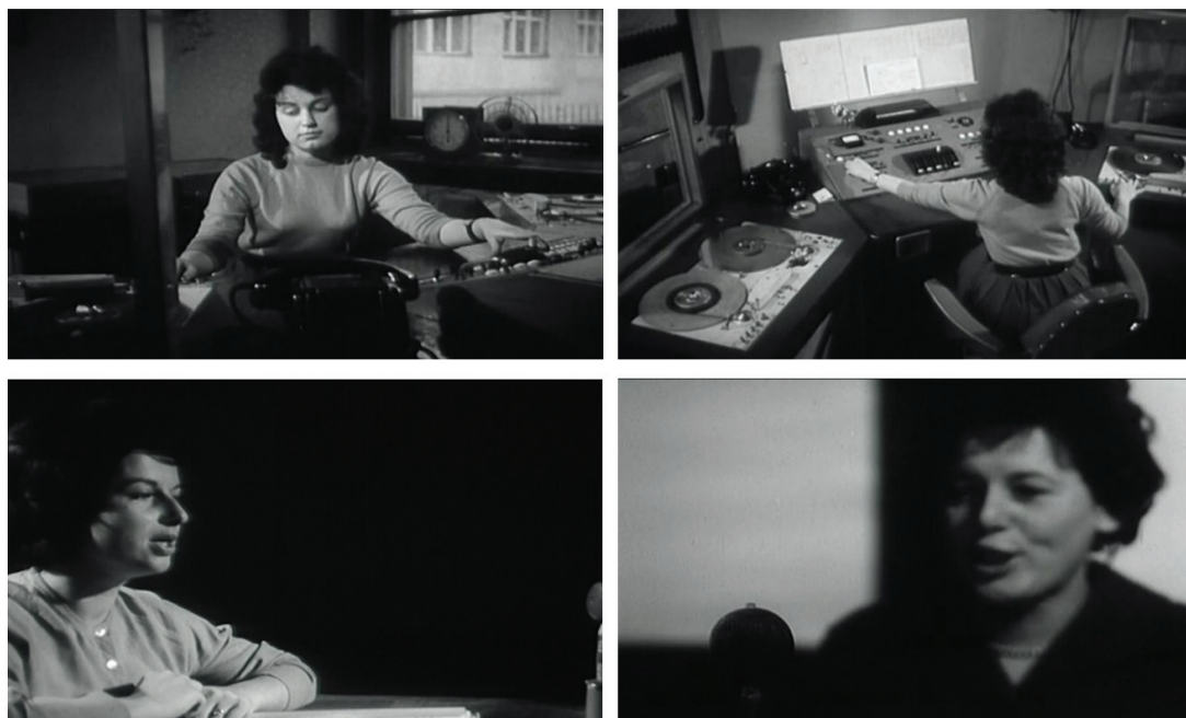
Figure 1a-f. Continued

We can extend the above analysis to self-reflective practices of television and radio professionals in relation to their own production practices, including production and contextual documentation, via audiovisual and written texts and activities (internal, semi-internal and publicly accessible), such as internal reports. 23 Sometimes such internal reports were also ' visualized ' in discussions on television as they related to larger discussions in society, specifically on the role and representation of women in/on radio and television, and in jobs at these institutions. In an RTÉ Late Late Show special looking at the representation and portrayal of women in the media from 1980, a panel and the studio audience discuss how women are represented and portrayed in and on Irish radio and television. A report submitted to the RTÉ Authority by a committee led by Senator Gemma Hussey is the starting point for the discussion. Introductory remarks from the report are read out aloud on television: