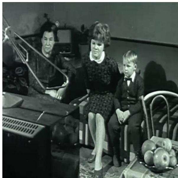
Figure 3. Television's-eye view of a small living room. 29

Eastern Europe, this was a key aspect of broadcasting that took on new importance in the Cold War era. 30 Not surprisingly, either, most traces of the most famous Cold War radio Radio Free Europe in the former Soviet bloc are from 1991 after the collapse of the communist regimes, with the exception of a mention of the station as a harmful influence in a Czechoslovak news segment on protests in October 1989 . Beyond the Cold War, shortwave broadcasting took on a new and multi-layered importance, embraced by UNESCO among others as a peaceful means of international understanding and global development, 31 not to mention continuing for many countries, including Britain, France and the Netherlands, a complicated connection to (former) colonial holdings. 32 As Komska argues, overseas broadcasters relied in particular on visualizations . Not necessarily for their own audiences, but for the 'home' audiences for whom their voices (supposedly speaking for the nation) were not familiar – or, in the case of foreign languages services, even intelligible. 33