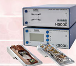
HALL EFFECT STUDY SYSTEMS AND MAGNETS