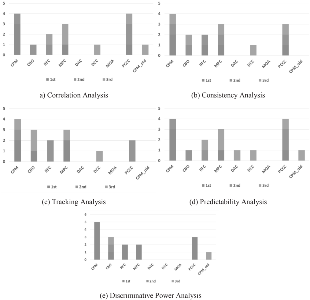
Figure 5.5.2.a: Reliability Assessment

To obtain a synthesized view of the aforementioned results in Table 5.5.2.a we adopt a point system to evaluate the consistency with which each assessor is highly ranked among others in the multiple criteria. In particular, for every top-1 position we reward the assessor with three points, for every second position with two points, and for every top-3 position with one point. In Table 5.5.2.a each row represents a criterion, whereas each column an assessor of change proneness. The cells represent the points that each assessor is gratified for each criterion. The last row, presents a sum of all criteria. Similarly, to before, bold fonts represent the most valid assessor.