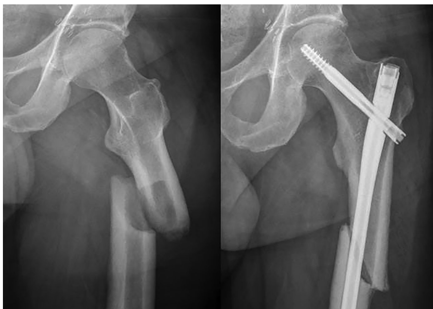
FIGURE 2 Pathologic femoral fracture treated by intramedullary fixation

been developed with the goal to improve outcome and/ or to decrease morbidity. First, the addition of postoperative EBRT to HILP and delayed surgical resection resulted in a significant improvement in local control without increasing morbidity in ESTS patients. 26,27 Moreover, a follow-up study showed that dose reduction and a shorter HILP duration was safe and effective for patient outcome, as the 5-year local control rates and (limb) survival were not compromised. 28