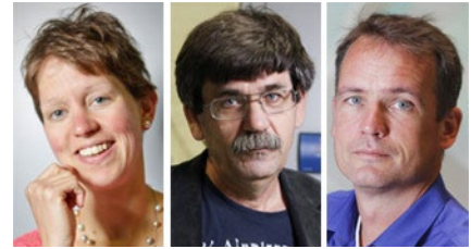
Insight from Mirjam E. Belderbos, Leonid Bystrykh, and Gerald de Haan

For instance, the mechanisms guiding HSC migration to and from specific anatomical sites remain unclear. Understanding these mechanisms is of great interest, as this may yield new therapeutic opportunities to enhance/accelerate HSC engraftment upon transplantation. The work by Wu et al. (2018) is consistent with a tri-phasic model of HSC engraftment and mobilization upon HSCT (see figure, part A). First, transplanted HSCs home and