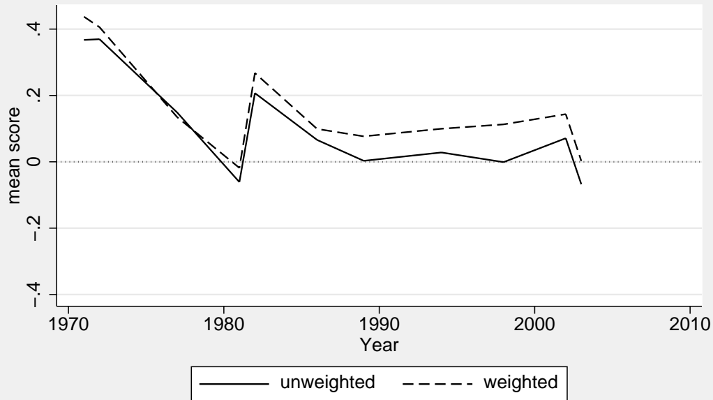
Figure 1 Feeling of political inefficacy The Netherlands, 1971 – 2003

Unweighted and weighted data, four external efficacy items. Questions asked in pre-election interviews (1971–77), or post-election interviews (1981–2003)