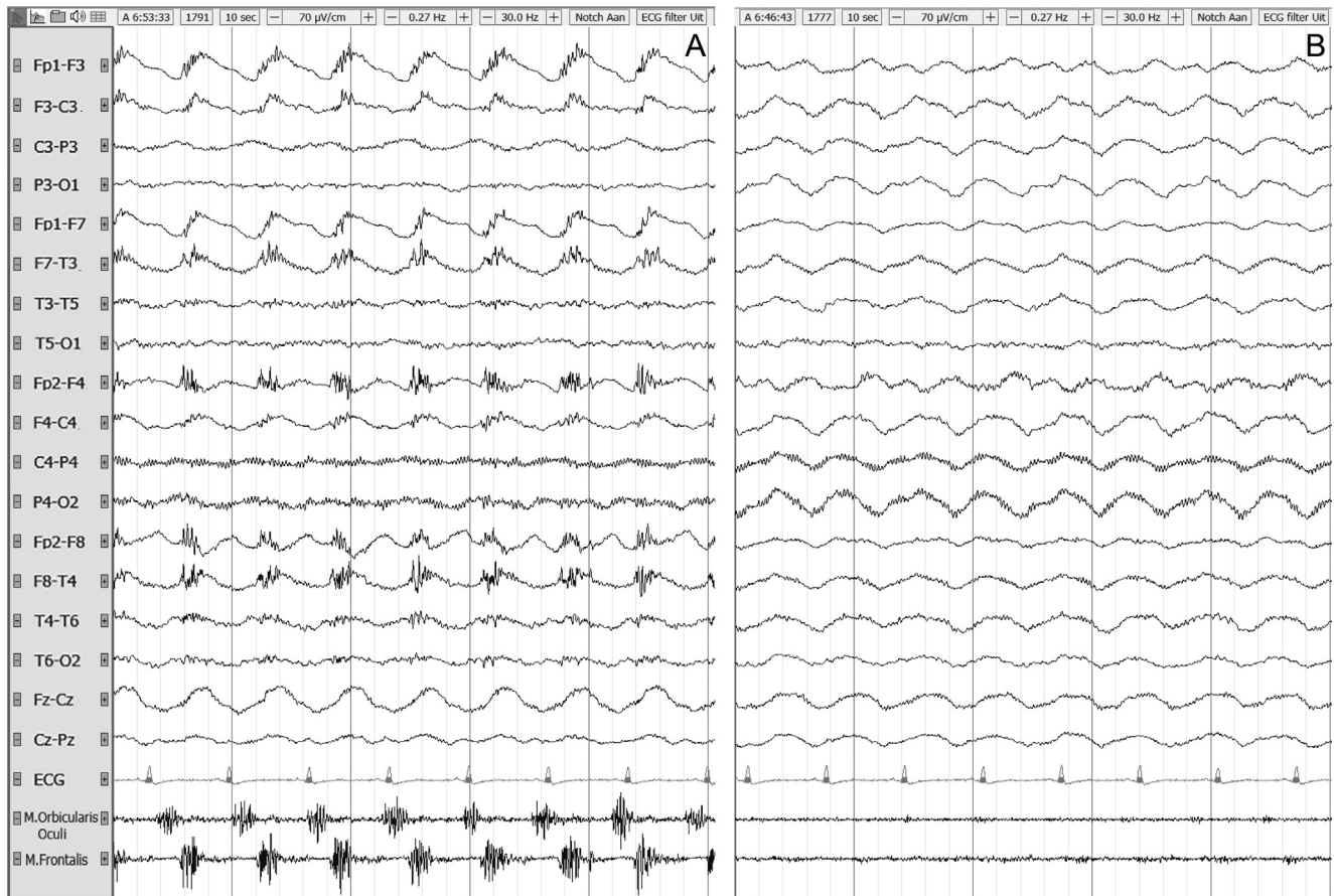
Fig. 1. EEG with video and orbicularis oculi and frontalis muscle EMG coregistration during a five second episode of orofacial dyskinesias showing a delta brush pattern (A). The M. frontalis EMG channel was derived from the frontopolar EEG electrodes. EMG activity of the orbicularis oculi and facial videorecording including the frontalis muscles was rhythmic with the same frequency, with contraction of these muscles that were mostly asynchronous and in anti-phase, and of which the frontalis muscle activity coincided with the brush component of the delta brushes. During a five second episode without EMG activity, the delta brushes are absent (B).