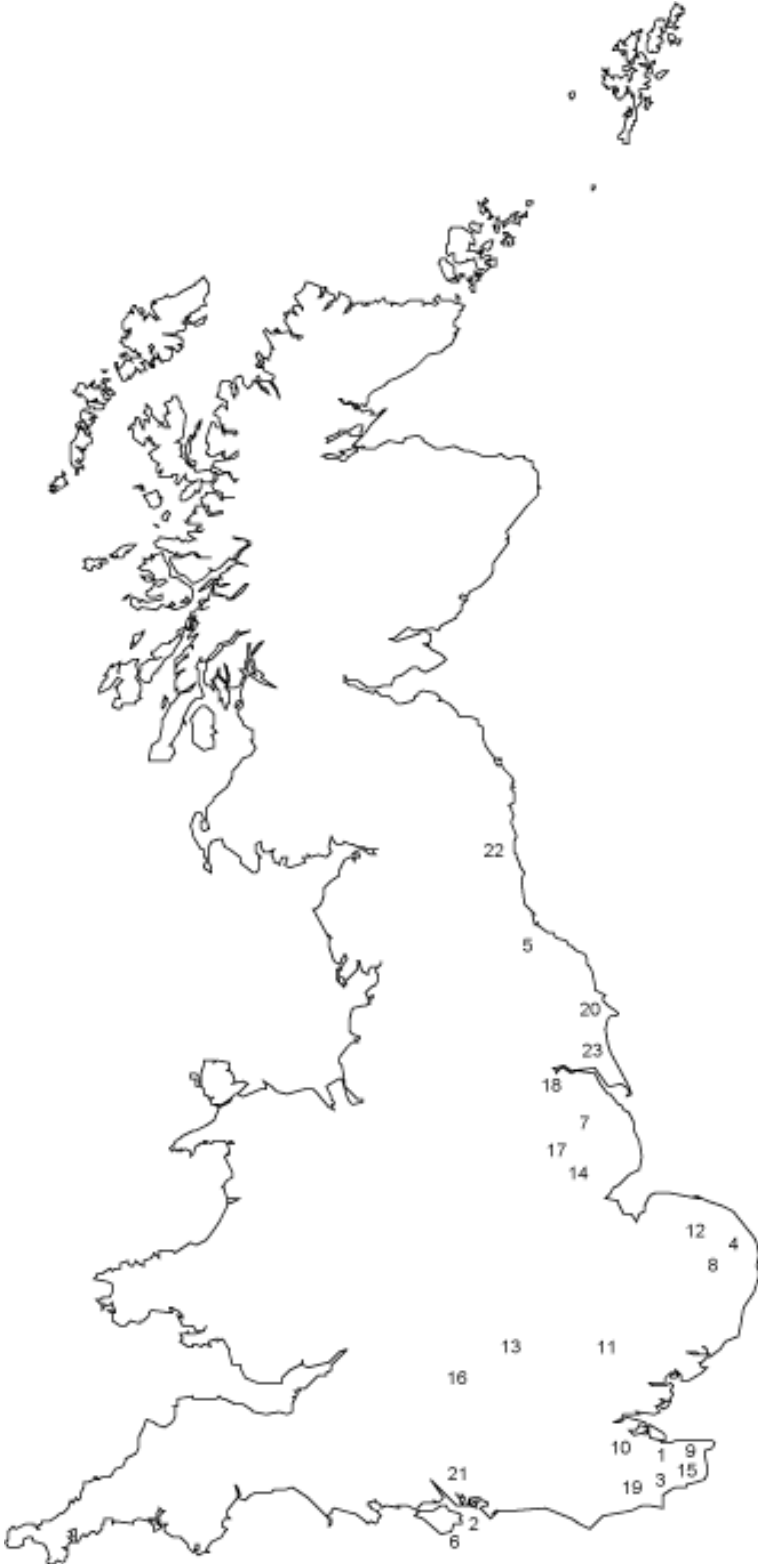
Map 8. Findspots of early runic objects in England.