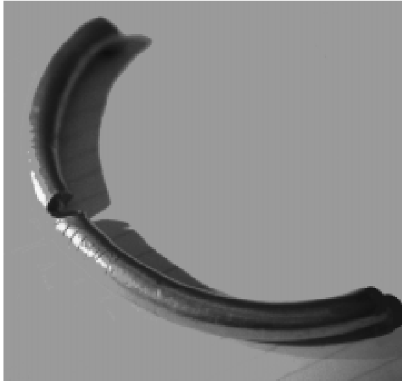
The two pieces of the neckring of Pietroassa.