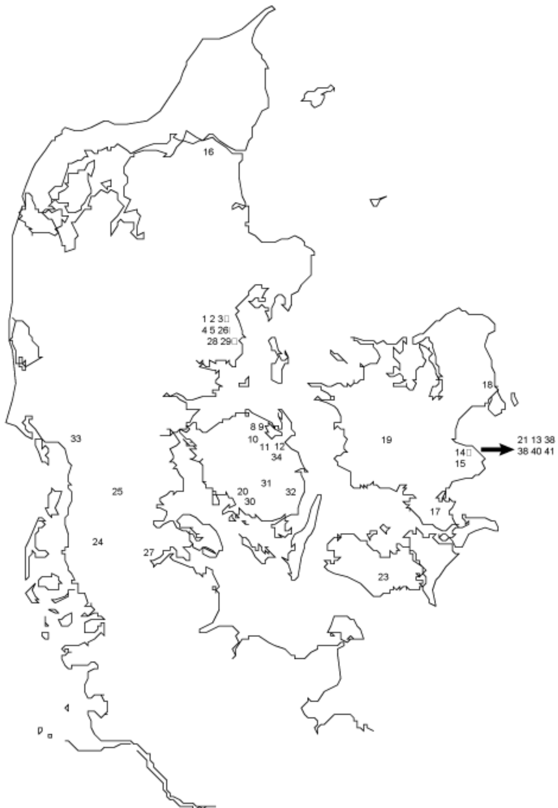
Map 4. Findspots of early runic objects in Denmark.