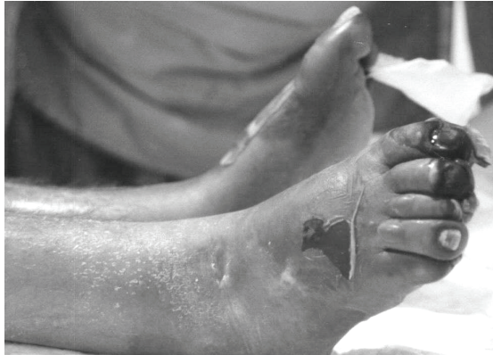
Figure 1: Both feet of the carcinoid patient at the time of admission with the peripheral necrosis.

A 60-year-old patient with spina bifida and a metastatic midgut carcinoid was admitted with ischemia and necrosis of both underdeveloped and short legs (see figure 1). On admission both femoral and popliteal arteries were patent, and there was no apparent major arterial obstruction. It was hypothesized that a vasoconstriction of the arteries by circulating amines had resulted in recent ischemia. After 3 days the demarcation revealed irreversible ischemia necessitating an amputations. Immediately thereafter the popliteal arteries were dissected and collected in saline on ice and sent to the laboratory for in vitro vascular studies.