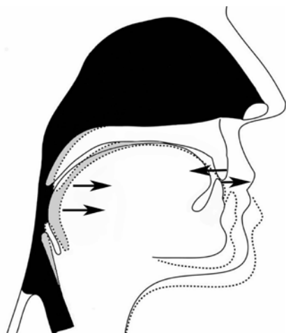
FIGURE 2. Effects of an oral appliance on upper airway patency and dentition.

Illustration of the increase in upper airway dimensions following repositioning of the mandible with oral-appliance therapy. The arrows on the teeth indicate the reciprocal forces that are generated by holding the mandible in a forward and vertically opened position. These forces transmit in a labial direction against the lower incisors and in a palatal direction against the upper incisors. On the long-term, this may change the inclination and position of teeth, affect the position of the mandible and increase the loading of the craniomandibular complex.