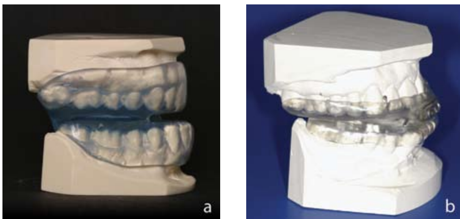
FIGURE 1. Lateral view of a one-piece and two-piece mandibular repositioning appliance.

(a) one-piece appliance placed on plaster casts; (b) upper- and lower-part of two-piece appliance placed on plaster casts (Figure 1b adopted from; Hoekema A, Wijkstra PJ, Buijter CT, van der Hoeven JH, Meinesz AF, de Bont LGM. Treatment of the obstructive sleep-apnoea syndrome in adults. Ned Tijdschr Geneeskd 2003;147:2407-2412).