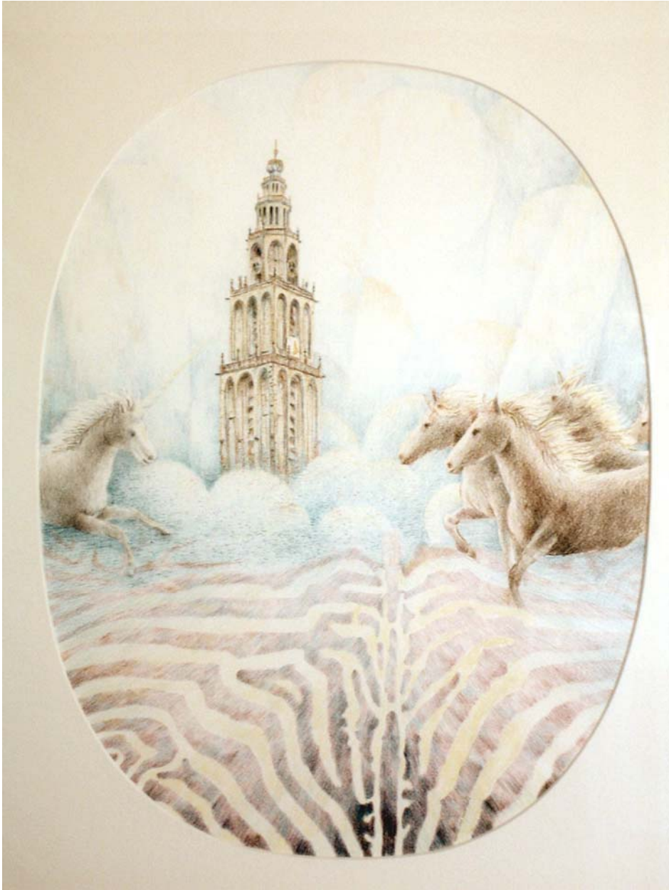
Hoefgetrappel op de Grote Markt