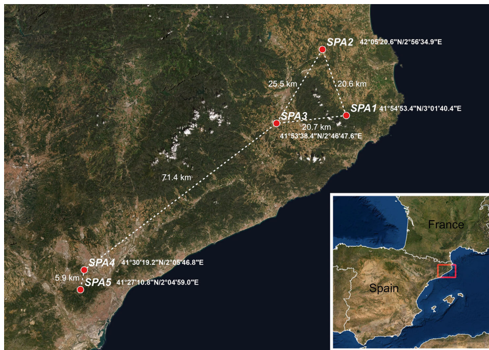
Fig. 1 Collecting sites of the 5 Spanish housefly populations (SPA1-5) in the province of Catalonia in Spain. All samples are from cattle farms in open landscapes.

autosomal marker recovery ratios and deviation from Mendelian segregation.