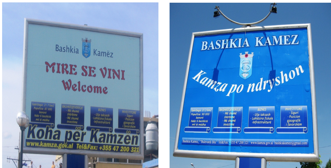
Figure 7.1 Welcoming billboard in Kamza 2008 and 2009

Internal migration patterns in Albania indicate a distinctive regional trajectory, with people moving from rural areas of the northeastern regions towards Tirana (urban/rural locations). According to recent estimations, the Tirana agglomeration holds approximately 75 percent of the country's total urban population (World Bank, 2007). Kamza, a suburb of Tirana, represents a unique case of urbanization in Albania (MoK, 2007).