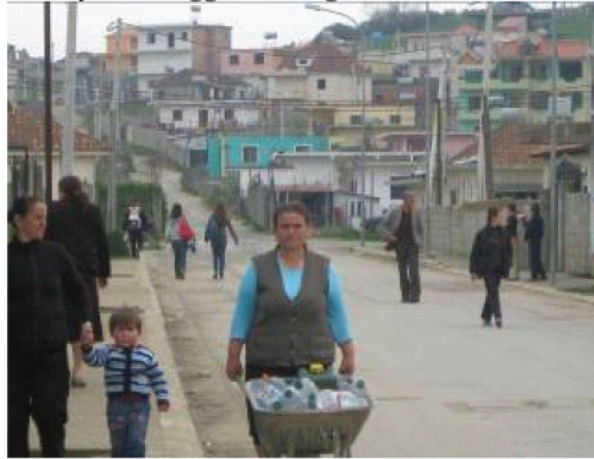
Figure 3, Women carrying water in Kamza