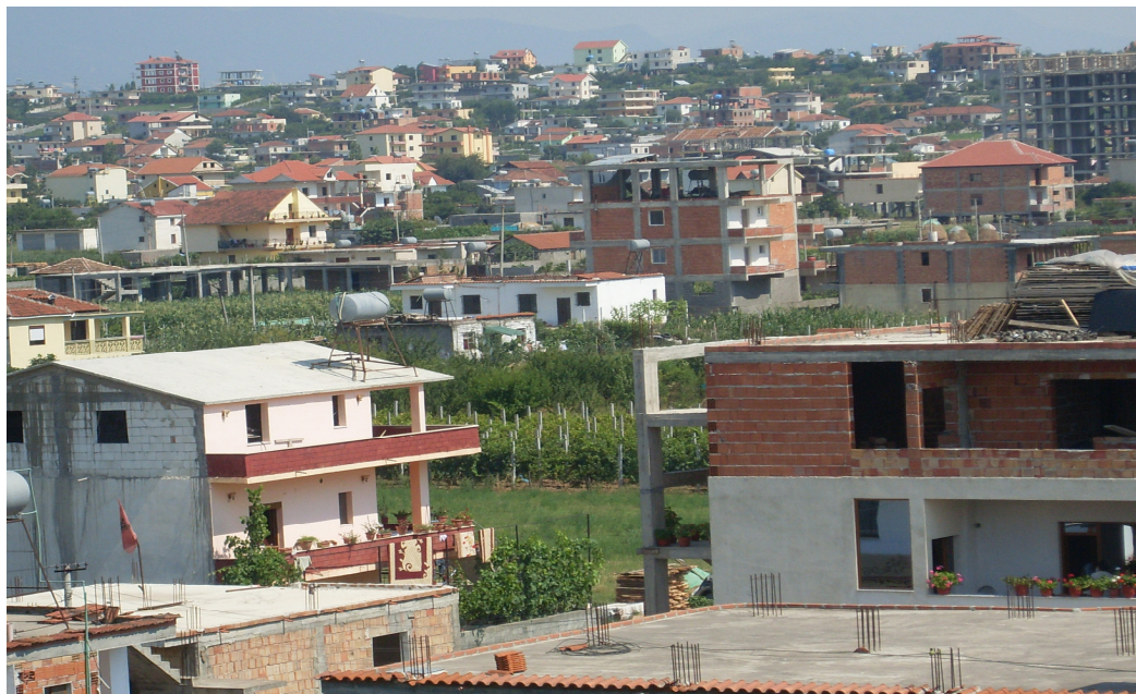
Figure 4.2 View of illegal settlements in Kamza

Since the 1990s, Kamza Municipality has grown to become one of Tirana’s largest informal housing settlements. Over 90 percent of all dwellings have been constructed illegally (Figure 4.2). In the early 1990s, Kamza was primarily agricultural land. At that time, the total population of Kamza was around 6000 inhabitants (Aliaj et al. 2003). Its population has grown substantially, numbering 90,000 residents in 2009 (MoK 2009). Today, Kamza is the sixth largest municipality in the country. Within Kamza we can distinguish Bathore, an informal quarter of Kamza Municipality. Bathore used to be inhabited agricultural land before the 1990s which today it counts more than 35,000 inhabitants (World Vision Albania, 2007).