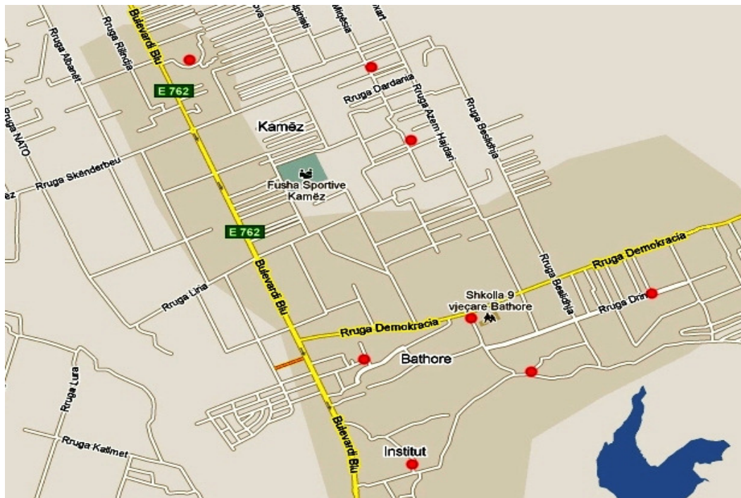
Figure 4.3 Research Sites

The fieldwork was conducted at eight sites in Kamza (Fig. 4.3). Four sites are located in Bathore (neighbourhood number four, five, six and seven) one site in Koder Kamza (at the Agricultural University) and three other sites located near the municipality of Kamza. Not all the research sites received the same attention. I lived in Bathore for more than two months. Moreover, because of the location of the two main CBOs, which acted as gate-keepers and key informants in Bathore, the four neighbourhoods (sites) in this area received much more attention from me. I therefore conducted almost all participant observation, visual materials acquisition and around thirty-two in-depth interviews in this area. At Koder Kamza I carried out my research by frequent visits, some participant observation of young people (this site also houses the Agricultural University) and five in-depth interviews with students. Several visits were paid to Kamza Centre, which is home to municipal offices. In the three sites near Kamza Centre, I gathered secondary data and information from the municipal authorities. Moreover, I conducted two expert interviews and three in-depth interviews.