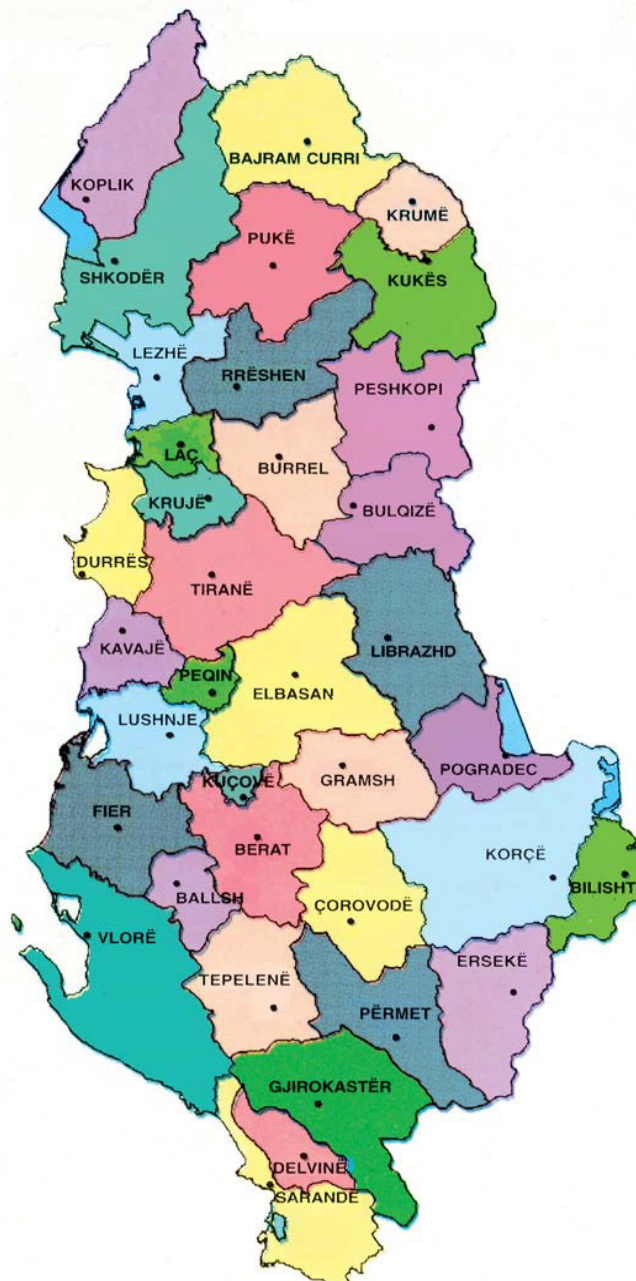
Figure 2.1 Administrative map of Albania

Even though there was intensive urban growth during this period (1923–1945), yet about 80 percent of the population of Albania was living in rural areas (UNDP, 2000: 46). Urban growth would not continue with the same intensity after 1945, as internal migration was strictly controlled during the communist regime.