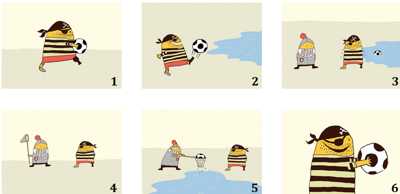
Fig 1. Example of storybook. Example of a storybook of the Reference Production Task. Each picture was shown on a separate page.

Reference production task. We used the reference production task from Hendriks et al. [4] that consisted of four storybooks containing six pictures each (see [43] for examples of the materials). Each picture was on a separate page. The four storybooks were constructed in the same way (Fig 1): in the first two pictures, one character was present, to prompt the introduction of a new character and the maintained reference to this character. We expected participants to introduce this character with a full NP (e.g., ‘the pirate’ or ‘a pirate’). To maintain reference to this character, we expected participants to mainly use pronouns. In the third picture a second character entered the story. In the fourth and fifth pictures, this character