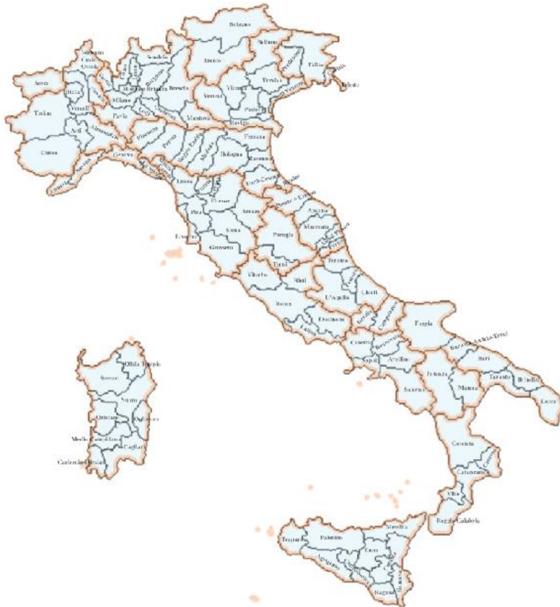
Figure 1.2: Visualisation of the interactive map of Italy showing the administrative Regions and Provinces