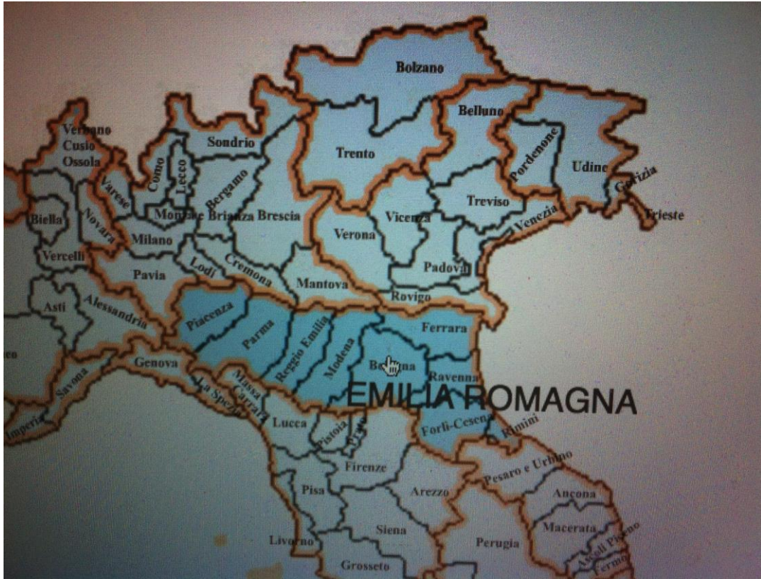
Figure 1.3: The highlighting of the Regions (in the example, Emilia-Romagna)