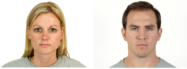
Figure 1. Two examples of the 100 pre-tested photographs retrieved from the Chicago Face Database (Ma et al., 2015) and employed in Studies 1–3.

As a first step, we ran a pre-study to: (1) select 50 photographs each of men and women matched on ratings of competence, dominance, morality, sociability, and attractiveness; and (2) obtain ratings of facial stereotypic qualities to use as independent variables in our studies. We chose the 183 (93 men and 90 women) photographs depicting White faces from the Chicago Face Database (Ma, Correll, & Wittenbrink, 2015), as this is the majority ethnic group in the United Kingdom (where the studies were conducted), and to avoid ethnicity as an additional source of variation (e.g., see Sutherland et al., 2018, on ethnic differences in face perception). The individuals depicted in the photographs had uniformly neutral expressions, and all wore grey t -shirts (see Figure 1).