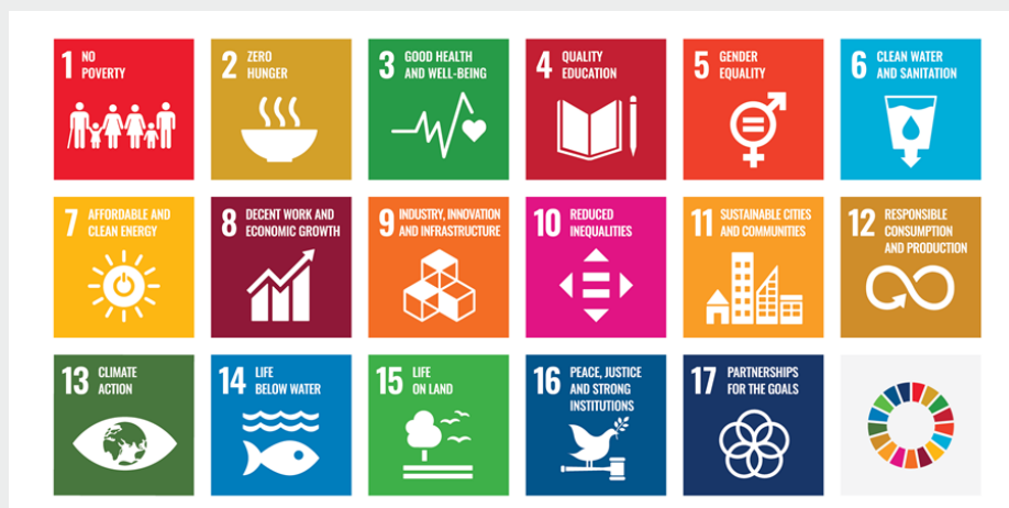
Figure 2. United Nations Sustainable Development Goals