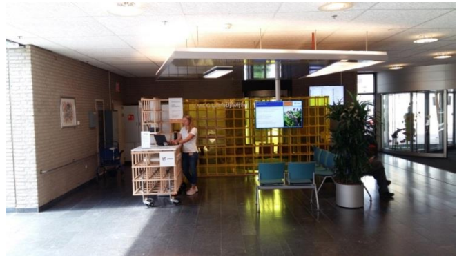
Figure 3: UMCG Lifestyle Navigator at central location