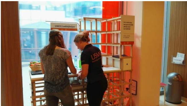
Figure 2: Mobile desk in waiting room outpatient clinics

Currently, in the second phase of development, the UMCG Lifestyle Navigator is situated at a central location (fig. 3) in UMCG and open for patients as well as for visitors and UMCG employees (4 days a week, 4 hours a day). Regarding patients' attendance we provided the involved medical staff with a lifestyle recipe in order to refer patients to the UMCG Lifestyle Navigator. In addition, at the central location printed information (brochures) and digital information (short instructional movies) are offered.