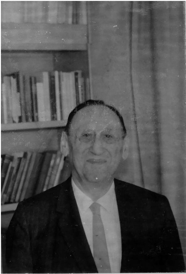
Leo Kanner in 1963.