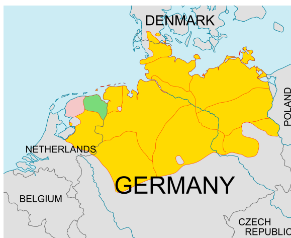
Figure 1: Geographical areas where Gronings (in green) and West Frisian (in red) are spoken.

To test if this procedure is also effective for low- to zero-resource languages, we consider two regional language varieties spoken in the North of the Netherlands, namely Gronings (Low Saxon language variant) and West Frisian.