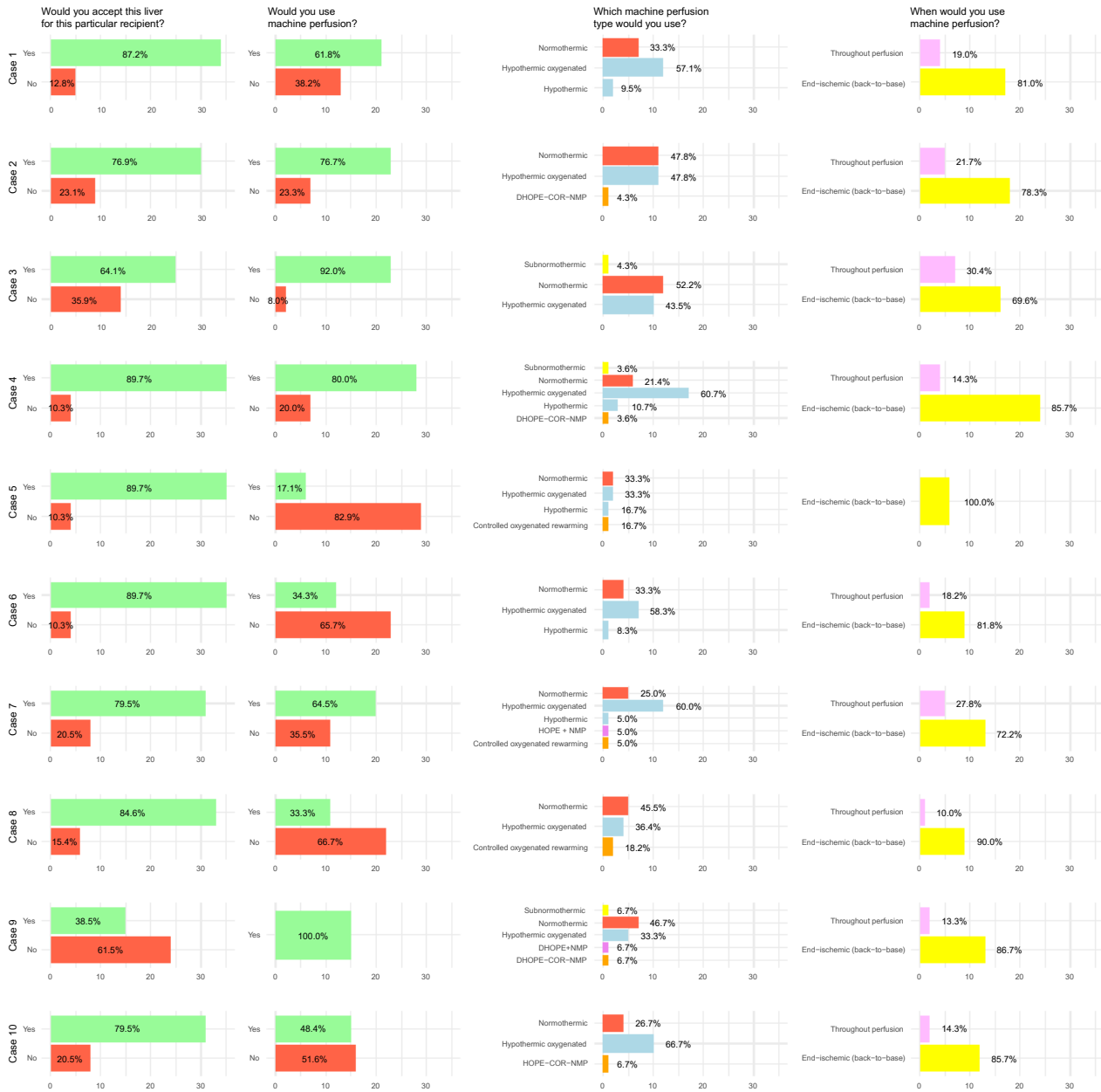
FIGURE 1 Survey answers [Color figure can be viewed at wileyonlinelibrary.com]

North America and South America, respectively. Centre volume was \geq 100 , 50-100, and < 50 for 10 (25.6%), 19 (48.7%), and 10 (25.6%) respondents, respectively. Five respondents were from centers without an established MP program.