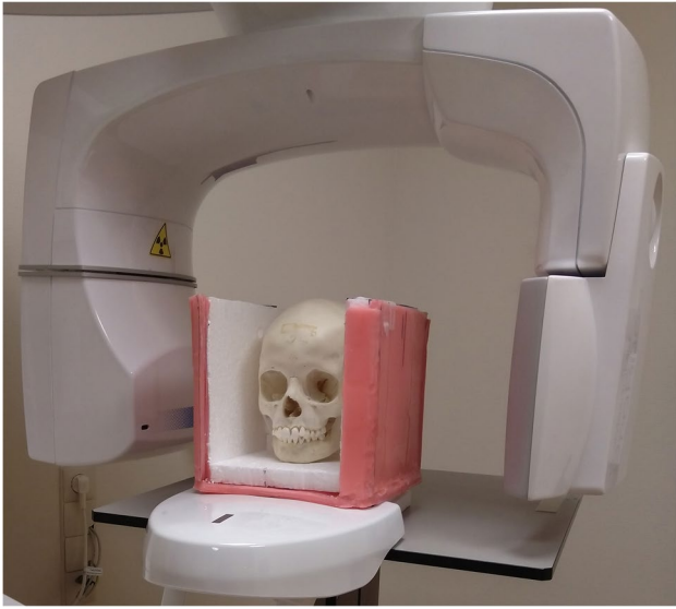
Fig. 1 Dry skull in EPS box with 1-cm utility wax positioned in CBCT machine (front part removed for photo)

CBCT dataset, a lateral cephalogram was reconstructed (RLC) using ROMEXIS software (Fig. 2).