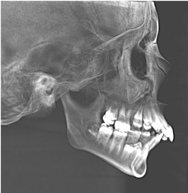
Fig. 2 Reconstructed lateral cephalogram from ultra low dose-low dose CBCT

After the ULD LD CBCT was made, the EPS box with skull was moved to the cephalostat of the same machine. The skulls were positioned in natural head position on visual estimation in relation to the vertical measurement nose-rod. Standard dose lateral cephalometric radiographs (SLC) were taken at 10 mA and 66 kV for 6.79 s (Fig. 3). These exposure