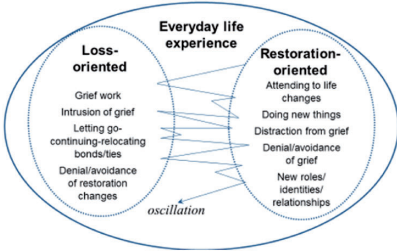
Figure 1. The Dual Process Model of Coping with Bereavement Stroebe & Schut (1999).

particularly, with respect to the deceased person (e.g., visiting the grave to be close to the deceased; looking at photos of him/her). Restoration orientation refers to secondary (to the loss itself) sources of coping with stress. RO focuses on what else needs to be dealt with as a result of the loss, and how these matters are dealt with (e.g., taking up employment to compensate for the deceased's lost income; learning skills that had been done by the deceased).