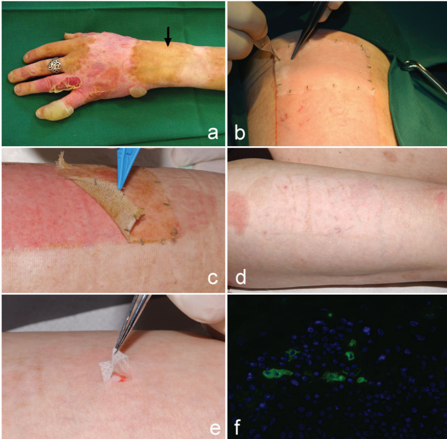
Figure 2. (a) A revertant skin patch before harvesting with a punch biopsy (arrow, future donor site). (b) Epithelial grafts are placed on the acceptor site. Note the metal clips at the edge that secured the graft to the gauze carrier. (c) Removal of the gauze carrier at day 7. (d) The acceptor site had healed without scarring at 4 months. (e) Positive adhesive tape test of the acceptor site reveals weak epidermolysis bullosa skin. (f) The graft stained for type XVII collagen with 3% positive keratinocytes.