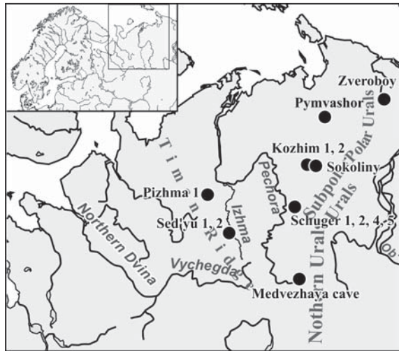
Figure 1. Map of micromammalian localities in northeastern Europe.

horizons (Smirnov, 2003). All the local faunas are recovered from localities of a single taphonomic type, namely zoogenic deposits in karst caverns. Fossil remains accumulated as a result of hunting activities of predators and raptors.