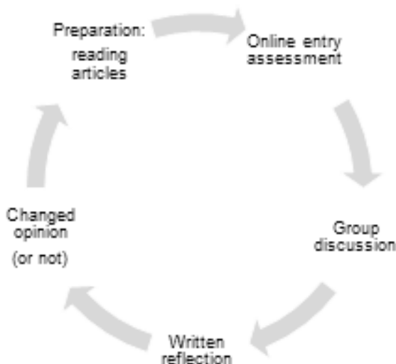
Figure 4 Lifelong learning cycle used in reflection of prefixed topics

In advance of the group meeting, the students have read selected articles to prepare for the topic discussion and complete an online entry assessment. During the group discussion the students compare their views with their peers. Afterwards, they write a reflection on the development of their views which might have been changed by the articles or the group discussion. The student chair prepares the discussion and is free to use a quiz, to formulate statements to discuss, to give a presentation on the topic or to show a YouTube film from the internet.