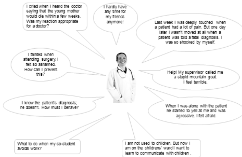
Figure 3 Topics of peer mentoring

week. Next, the students are stimulated to bring in similar experiences. We finish this peer mentoring hour with an evaluation of the group process by the students as well as the coach. In this way students learn how to grow in their new professional roles and learn to discover and formulate their values.