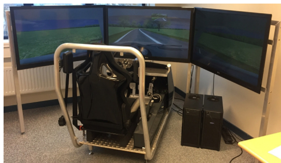
Fig. 1. The driving simulator.

Driving tasks The order of the driving tasks was fixed to minimise simulator sickness and to prevent transfer effects of fatigue. Experimenters provided participants with instructions before each ride according to a fixed protocol. During the