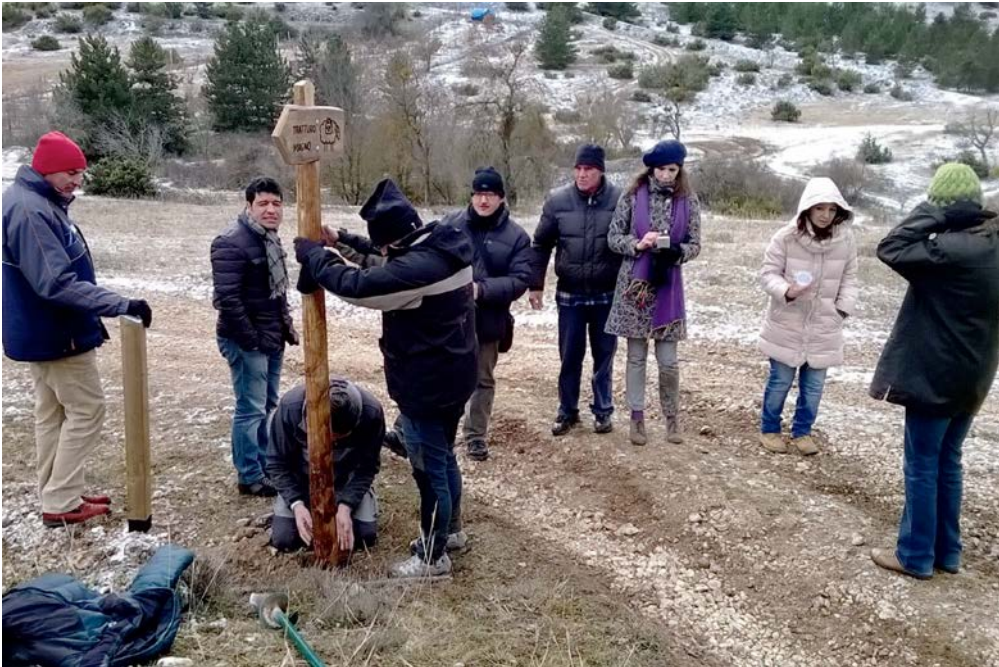
Figure 4.5: Building more resilience landscapes together.

The “engaging” phase gained institutional support for the Tratturo Magno project from some local municipalities. For example, one municipality contributed to restoring public access to a portion of the Tratturo Magno that had been inaccessible for over a decade. The process fostered additional local actions that enhanced the project’s outcomes. For example, one local NGO, using its own resources, engaged a local carpenter to improve tourist signage along the Tratturo Magno (Figure 5). These actions helped build a broad community vision that focused attention on common problems, shared solutions, and a shared perspective on sustainable development. This process gained formal legitimacy with the development of a collective agreement established in the final phase.