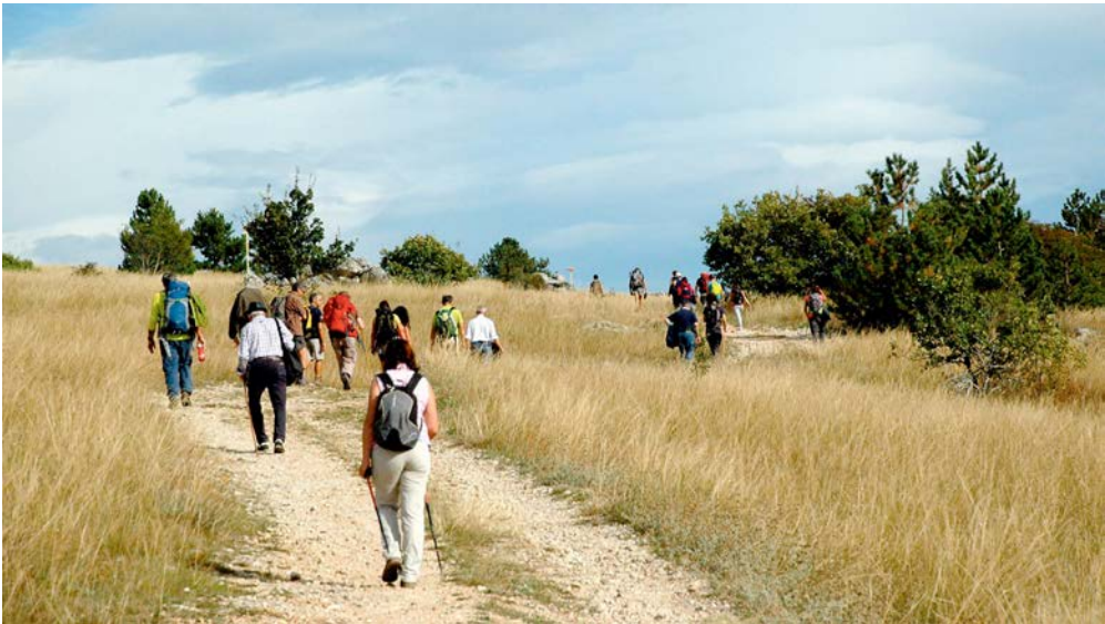
Figure 4.2: Trekkers along the Tratturo Magno.

A subproject of Vie e Civiltà della Transumanza focused on improving a section of the Tratturo Magno from the city of L'Aquila (42°20'34.40"N; 13°24'15.26"E) to the locality of Valico Forca di Penne near the village of Capestrano in the province of L'Aquila (42°16'55.00"N; 13°50'15.28"E) and a minor branch, the Regio Tratturo Cinturelli-Montesecco, which together total 62 km in length. Hereafter, activities related to restoring this section of the Tratturo Magno and the Regio Tratturo Cinturelli-Montesecco are referred to as the Tratturo Magno project. These paths traverse 10 municipalities that were badly affected by the April 2009 L'Aquila earthquake. The lead author of this paper, an Italian social research consultant, was engaged by the Local Action Group Gran Sasso-Velino to support the Tratturo Magno project by gathering tourism data and assisting with community engagement activities.