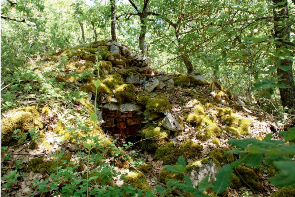
Figure 4.4: An ancient shepherds’ refuge.

new international policy guidelines that emerge(d) during the life of the project. For example, “building the resilience of socioeconomic and ecological systems, including through economic diversification and sustainable management of natural resources” (UNFCCC, COP 2015: 25) and “handing back to local communities the management of and access to local resources” (Barca et al., 2014: 42) were added as key community development goals. These goals were subsequently redefined and better contextualized in discussions with local key actors, stakeholders, and other members of the public in subsequent phases of the SIA Framework for Action.