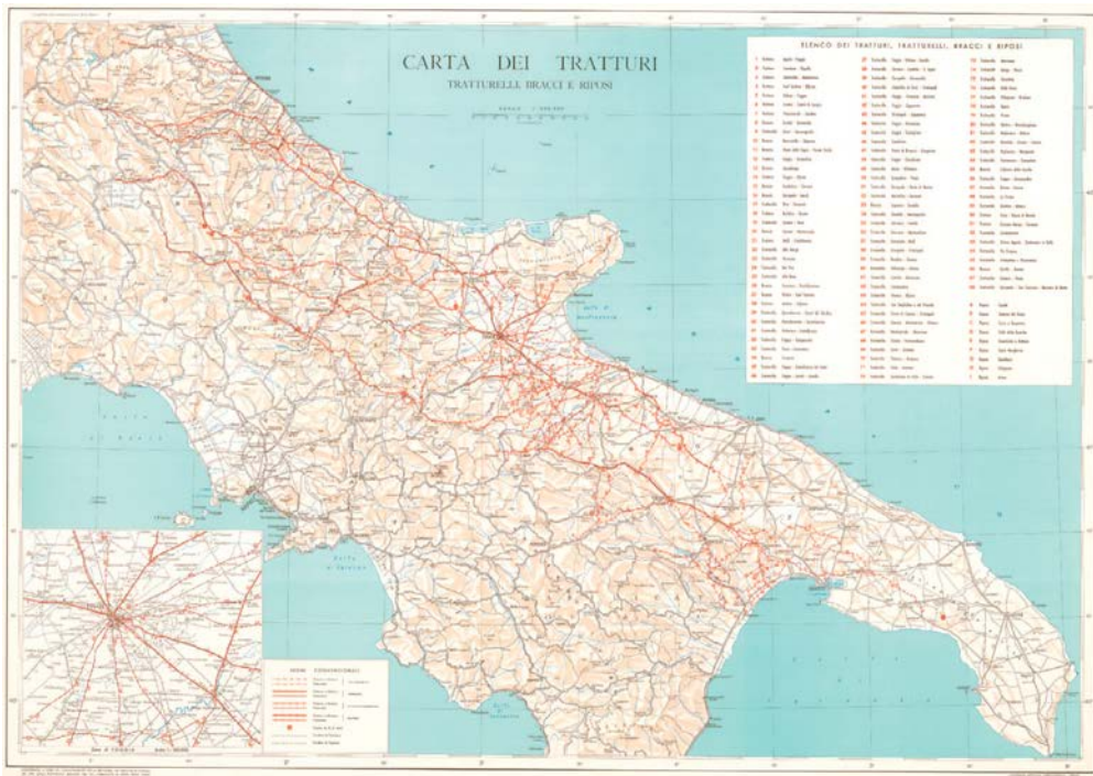
Figure 4.1: The network of tratturi in southern Italy, and location of the 5 royal tratturi . (Map provided by the Regional Office of Tratturi, Foggia, and adapted by the first author)

Tratturi (singular tratturo ) are public, grassy paths across which thousands of shepherds have moved their flocks, practicing transhumance, for centuries. Transhumance can be vertical, from highland to lowland pastures in the same region, or horizontal, across regions (Montero et al., 2009). Southern Italy contains an intricate network of tratturi that converge in the province of Foggia in the Puglia Region. The tratturi cross 6 Italian regions: Abruzzo, Molise, Puglia, Lazio, Campania, and Basilicata (Figure 4.1). The 5 most significant tracks are called the regi (royal) tratturi . By ancient decree, the regi tratturi are precisely 111 meters wide and are inalienable public lands (Marino 1988). At 244 km, the Tratturo Magno (Figure 4.2) is the longest. Although the tratturi remain common land, the practice of transhumance has changed over time, and the pathways have frequently been used for other purposes, such as railways and roads.