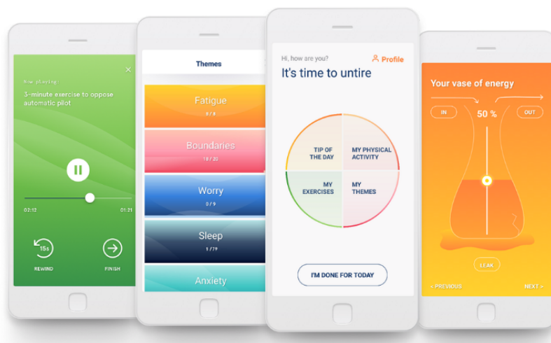
Figure 2. The Untire self-management app: (a) mindfulness-based stress reduction audio exercises, (b) psychoeducative themes, (c) the daily program, and (d) the vase of energy.

After opening the Untire app for the first time, participants received a short introduction on how to use the app. Participants were informed that every time they revisit the app (ie, reopen the app), a (new) daily program will be presented. The daily program consists of the 4 following core components: (1) My themes , (2) My exercises , (3) Tip of the day , and (4) My physical activity ( Figure 2 ). Participants also received information about the weekly assessments of their fatigue and related components, the so-called Quick scan . The Vase of Energy is an integral part of the Quick scan . Participants were also invited to think about informing a friend or family member, a so-called buddy , to help or motivate them to work with the app. All the modules are explained below in detail (also see Table 1 and Figure 2 ).