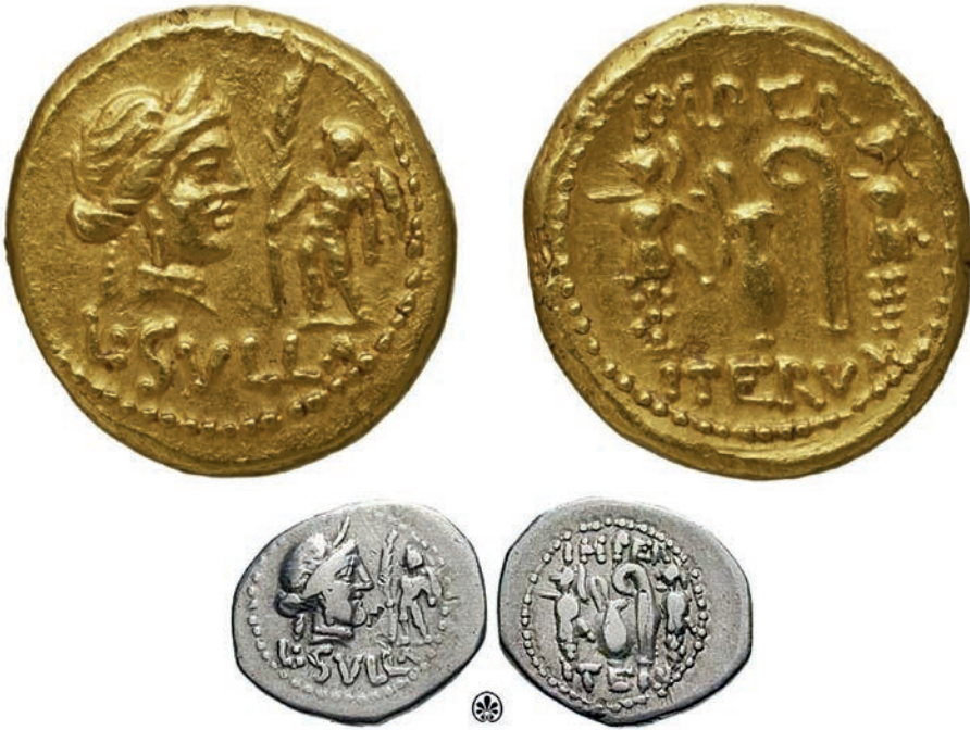
Figure 2: Aureus (10.81g; above) and AR denarius (below) of L. Cornelius Sulla (moving mint; 84/3). Obv. Head of Venus looking right, with eras standing in front of it looking left with palm-tree branch. Inscription L(UCIUS) SULLA below, all within a border of dots. Rev. Two trophies left and right, with lituus and jug between them. Inscription IMPER(ATOR) above and ITERU(M) below, all within a border of dots.

Roman Senator and close companion of Sulla. 37 Another pseudo-Athenian stephanephoros coin bears an owl standing on an amphora, framed by two trophies left and right – the trophies of Sulla’s victories at Chaironeia and Orchomenos – all within wreath. 38 One must note, in this case, the absence of the ethnic of the issuing authority.