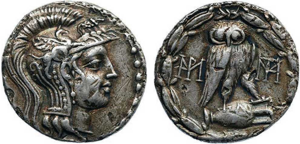
Figure 3: AR Pseudo-Athenian tetradrachm minted under L. Cornelius Sulla (moving mint; 84/3). Obv. Helmeted head of Athena to the right within border of dots. Rev. Owl standing on amphora with an inscribed A on it, with MAPKOY monogram to the left and TAMIOY to the right, all within wreath. Source: Thompson 1293 & 1313.

Given the different uses, timeframe, and audiences, I think it is more plausible to assume that the agency behind the iconographical choice for the stephanophoric issue with the Harmodios and Aristogeiton rests on Athenian agents. The Athenians were capable of following an exceedingly long tradition of political appropriation of historical events, another profound instance of anchoring if I may: they associated the sack of Athens with the expulsion of the tyrant(s) Aristion and/or Mithridates. However, in contrast to previous uses of the tyrannicides back in 307 (Diod. 20.46.2) 40 there is no explicit return to democracy. Thus, one ought to enquire further on the reasons.